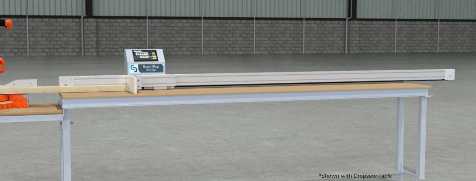
*Shown with Dropsaw Table